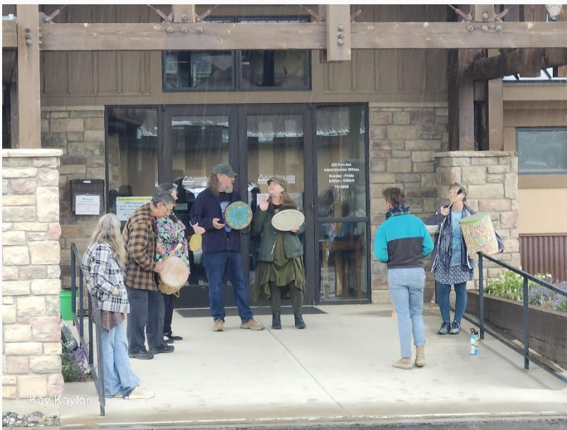
Drumming as part of the Earth Day 2026 Opening Ceremony; due to inclement weather, we met at the PLPOA Clubhouse.

When I Am Among the Trees – by Mary Oliver